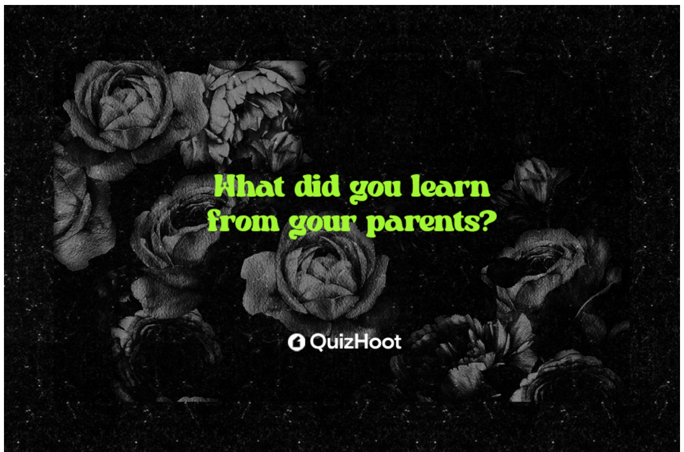
Random question to ask a girl